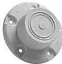
HTX IP54 grommets