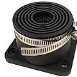
KUPO IP54 grommets