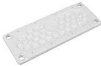
HTKC IP65 multigrommets