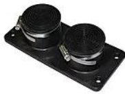
HIK IP54 multigrommets