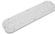
RIT IP65 multigrommets